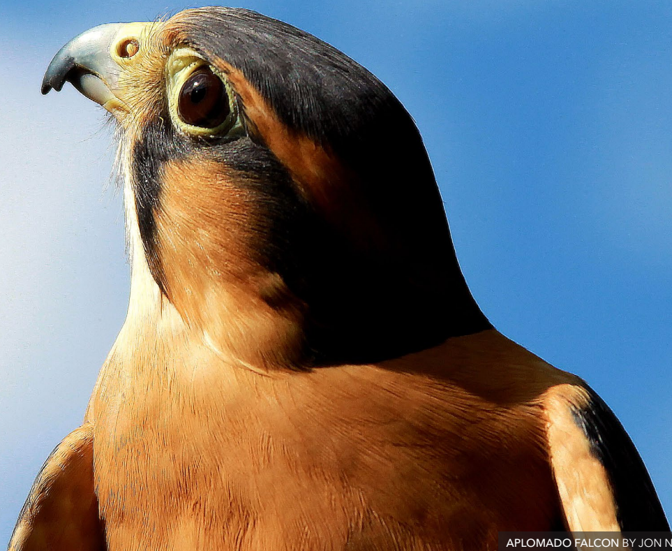
APLOMADO FALCON