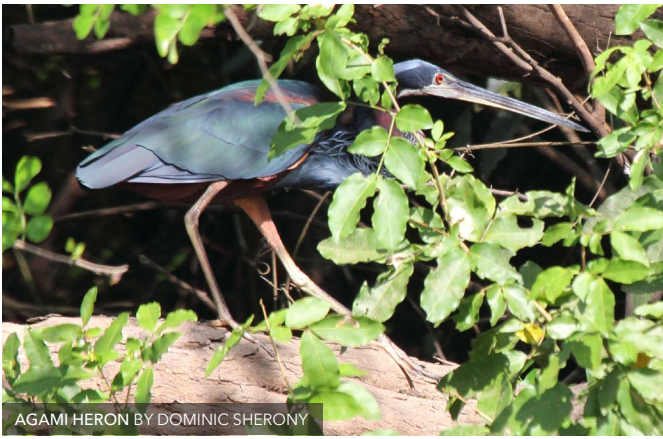
AGAMI HERON BY DOMINIC SHERONY

birding. Pook's Hill is situated within a private reserve, located at the foothills of the Maya Mountains in the Cayo District of Belize, and alongside the Roaring River. Birding right from the lodge, the meadow, and on the riverside is exceptional. There are often good sightings of trogons, motmots, and toucans. With over 300 birds recorded at Pook's Hill, it's also possible to see less common species, such as the Spectacled Owl, Emerald Toucanet, and Tody Motmot. This evening, explore the social and economic factors associated with conservation: engaging local people in the conservation and the habitat protection process. Later, an optional night walk may yield Black-and-white or Spectacled Owls. Overnight at Pook's Hill Lodge. (BLD)