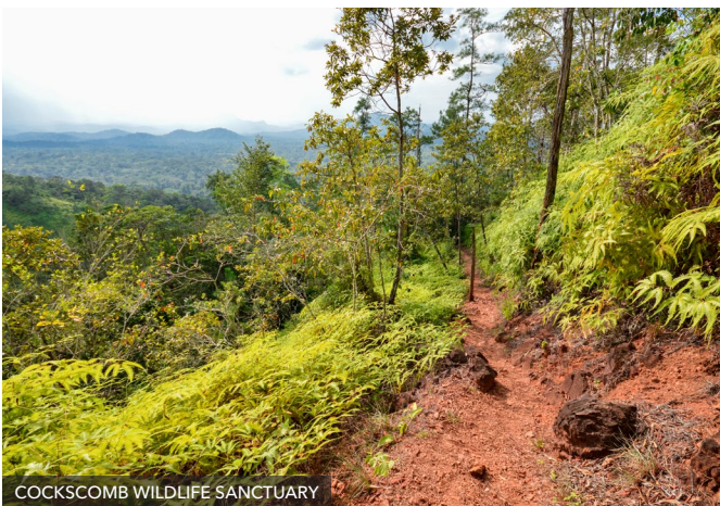
COCKSCOMB WILDLIFE SANCTUARY

After early morning birding, the group will transfer to the airport for flights back to the U.S. Please make sure flights depart after 12:00 pm. (B)