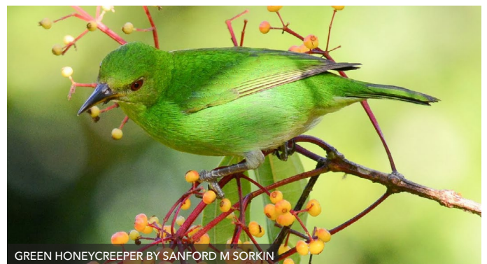
GREEN HONEYCREEPER BY SANFORD M SORKIN

Depart early for a day of birding at Cockscomb Basin Wildlife Sanctuary , a tropical moist forest sheltering an abundance of biodiversity - including 300+ bird species. Walk along its extensive trail system on the lookout for trogons, tanagers, flycatchers, and maybe a glimpse of a Yellow-billed Cacique. The sanctuary is also recognized as the world's first designated jaguar reserve, so keen observers might even spot a paw print in the forest. In the late afternoon, return to the lodge and bird along the trails for various hummingbirds, woodcreepers, flycatchers, and tanagers, plus Pheasant Cuckoo, Green Honeycreeper, Rufous-tailed Jacamar, Nightingale Wren, Green Shrike-Vireo, and White-winged Becard, among others. Overnight at Bocawina Rainforest Resort. (BLD)