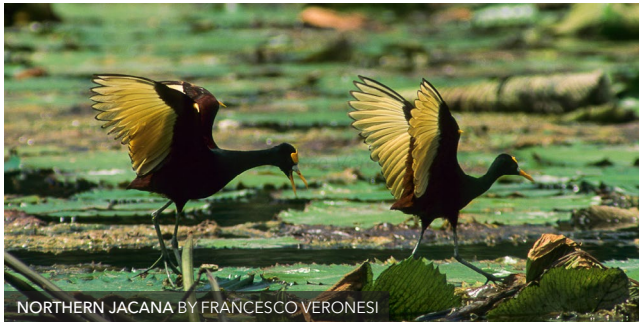
NORTHERN JACANA BY FRANCESCO VERONESI